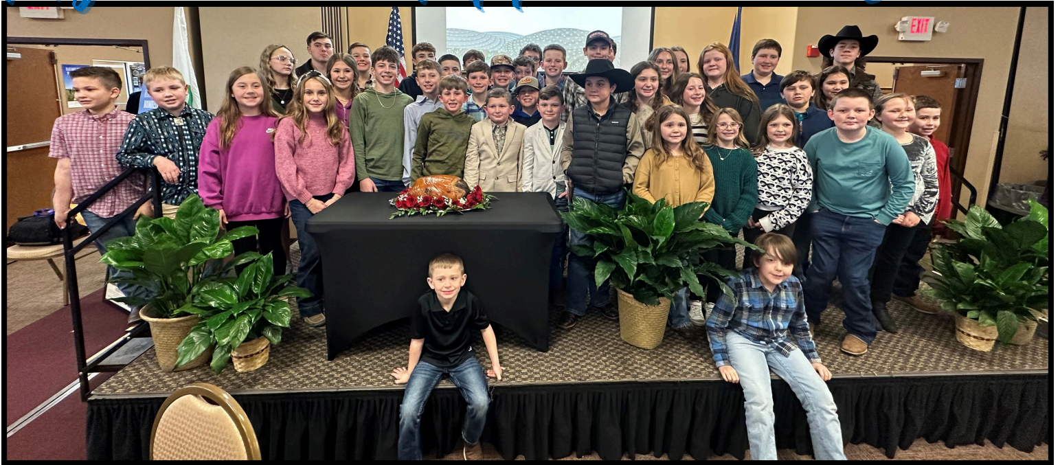
Pictured above are the 4-Her's that attended the 2025 Agriculture Appreciation Lunch with the Country Ham that raised over $13,000 for local 4-H programs.